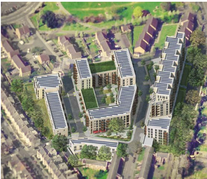
Aerial view of the new Sherwood Close

The design team are delighted to announce that the planning application for Sherwood Close has been successful with all members of the committee voting in favour of the scheme. We would like to thank residents for their support especially the resident steering group who have been with us every step of the way, including writing a letter of support for the redevelopment.